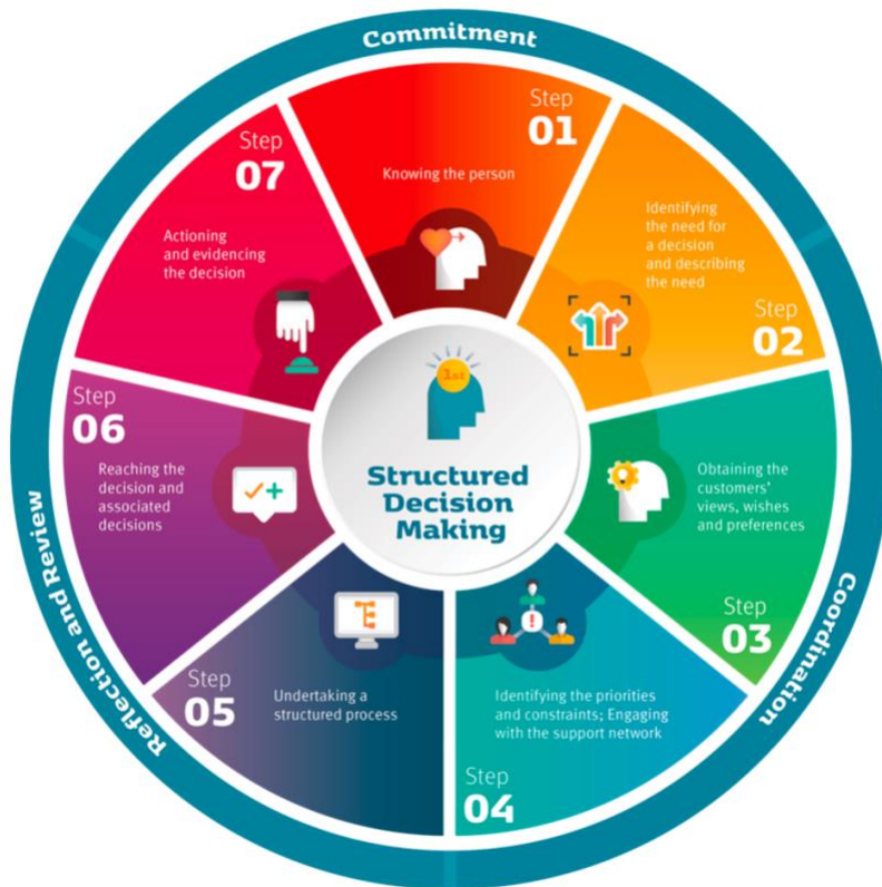
Figure 1. Structured Decision Making, Steps and Principles